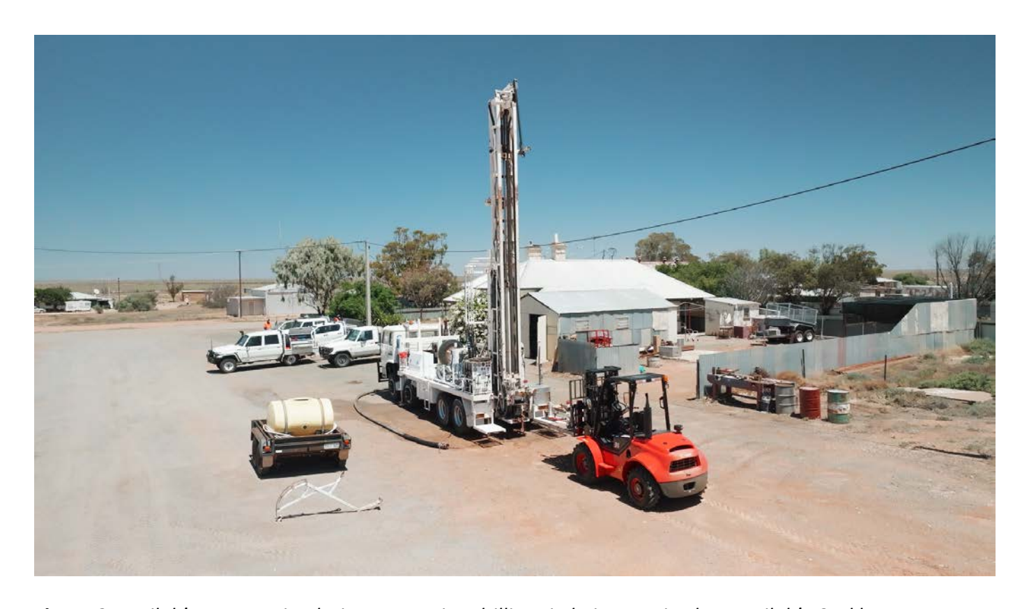
Figure 2 Havilah's reverse circulation percussion drilling rig being serviced at Havilah's Cockburn exploration base-camp prior to being mobilised to the first of its planned 2023 drilling sites last week.

"Deploying a contractor drilling rig for a short time will allow us to accelerate our drilling program."